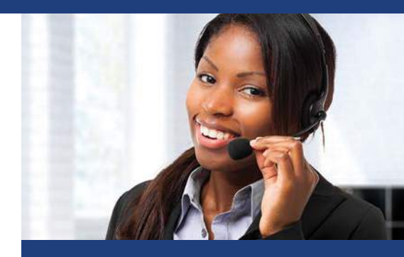
We're just a phone call– or a click–away!

Our Goal – is to create a positive difference in your life.